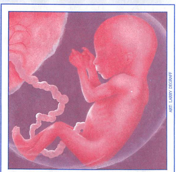
Preborn child at 16 weeks (4 months).

God defends the unborn, the innocent, the one who cannot speak for himself... that tiny individual who will never again be duplicated in all of human history!